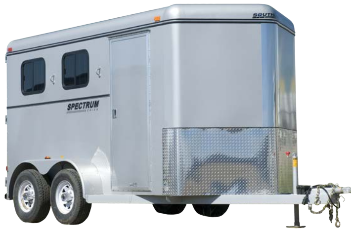
14ft 2HA TAG