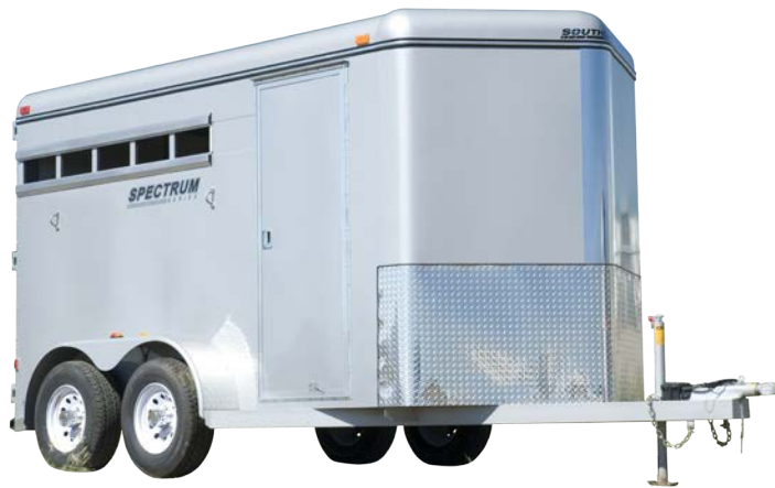
14ft 2HA TAG COMBO